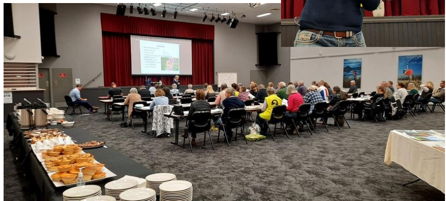
Below: Participants enjoyed the free workshop and morning tea.