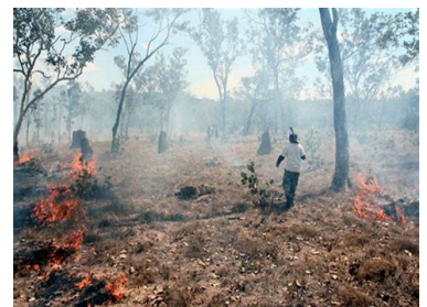
Below: Patchy/ mosaic burning reduces fire loads and maintains habitat.

We look forward to developing skills and confidence to include these methods in our efforts to care for the land.