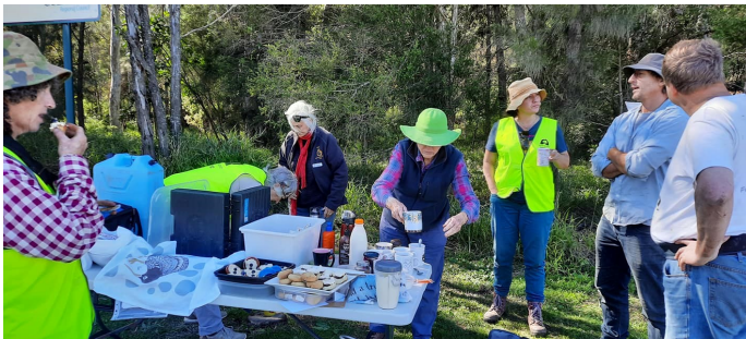
Above: "Base camp" for our weed work.